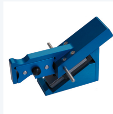
Slide Cut Mechanism